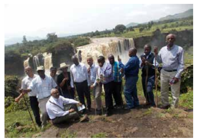
Tis Issat Falls at the outlet of Lake Tana into Abbay/Blue Nile

The main event was a one-day field visit to the Tana-Beles Integrated Watershed Management Project field sites in and around Debretabor in the South Gondar Zone of Amhara Regional State. This is one of the most critical regions which contributes huge amount of sediment load to the Abbay/Blue Nile system and water infrastructure downstream in Sudan and Egypt. The visit took the participants