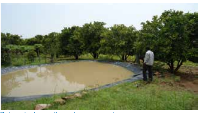
Rain water harvesting using geo membrane