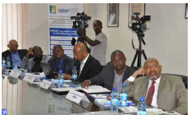
Presentation for the visitors at ENTRO

Facilitating cooperation and dialogue among member states constitutes one of two core functions of the Nile-Sec of the Nile Basin Initiative, the organizer of this visit. The impetus for organizing this Knowledge and experience sharing visit tailor-made for the PMSCs, the first of its kind, arose from the realization that despite the potential high stakes role they play in supporting Nile Basin cooperation, so far NBI has not engaged this important group of high-level policy making stakeholders with the required vigor and attention.