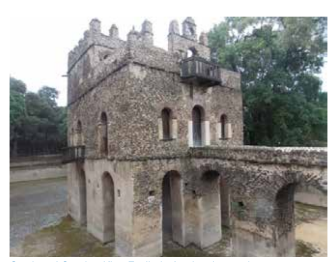
Castles of Gondar: King Fasiledes' swimming pool

The last leg of the visit was to Gondar, the capital of Ethiopia in the 16th century. The participants visited the Swimming Pool of King Fasiledes (below), the main castle complex, Debreberhan Selassie and the famous wall paintings, and a panoramic view from the Goha Hotel, overlooking Gondar. Upon return to Bahr Dar the participants held a reflection session on the entire visit during which the PMS expressed views, as below.