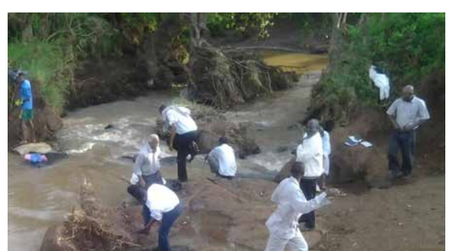
Examining damages in unmanaged watershed