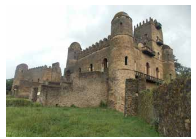
Partial view of the Fasiledes castle complex, Gondar