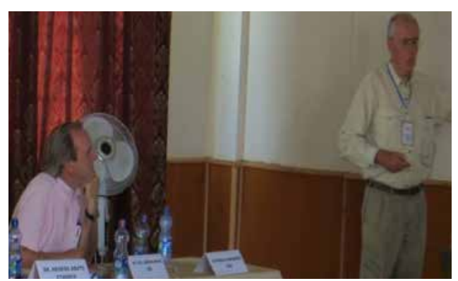
Consultant presentation and training

Dam construction and operational safety management has become an emerging issue for the EN region. To reduce the risk of dam failure and accidents caused by uncoordinated operations and divergent dam safety criteria and operational strategy across the EN sub basin, ENTRO has initiated studies to formulate dam safety guideline and a Road Map for the preparation of EN dam safety framework. ENTRO organized a three day workshop to take the first steps to address the above concerns. A total of 25 participants attended the training workshop which was held 07-09 October 2013 in Nazareth, Ethiopia. Of these, 13 participants were drawn from government offices of the four Eastern Nile countries, 3 from Academia/ Research Institutions, 6 from ENTRO, and 3 were private consultants. In terms of gender composition, 12% were female participants.