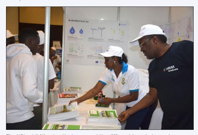
The NBI exhibition booth show cased the different knowledge and communication products