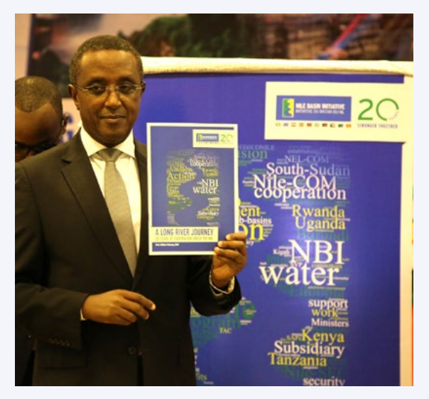
Hon Dr Vincent Biruta Rwanda's Minister of Environment unveils the publication

The publication also attempts to show why the NBI is critical for the Nile to survive as one system that can benefit all; and what real collective action can and does achieve.