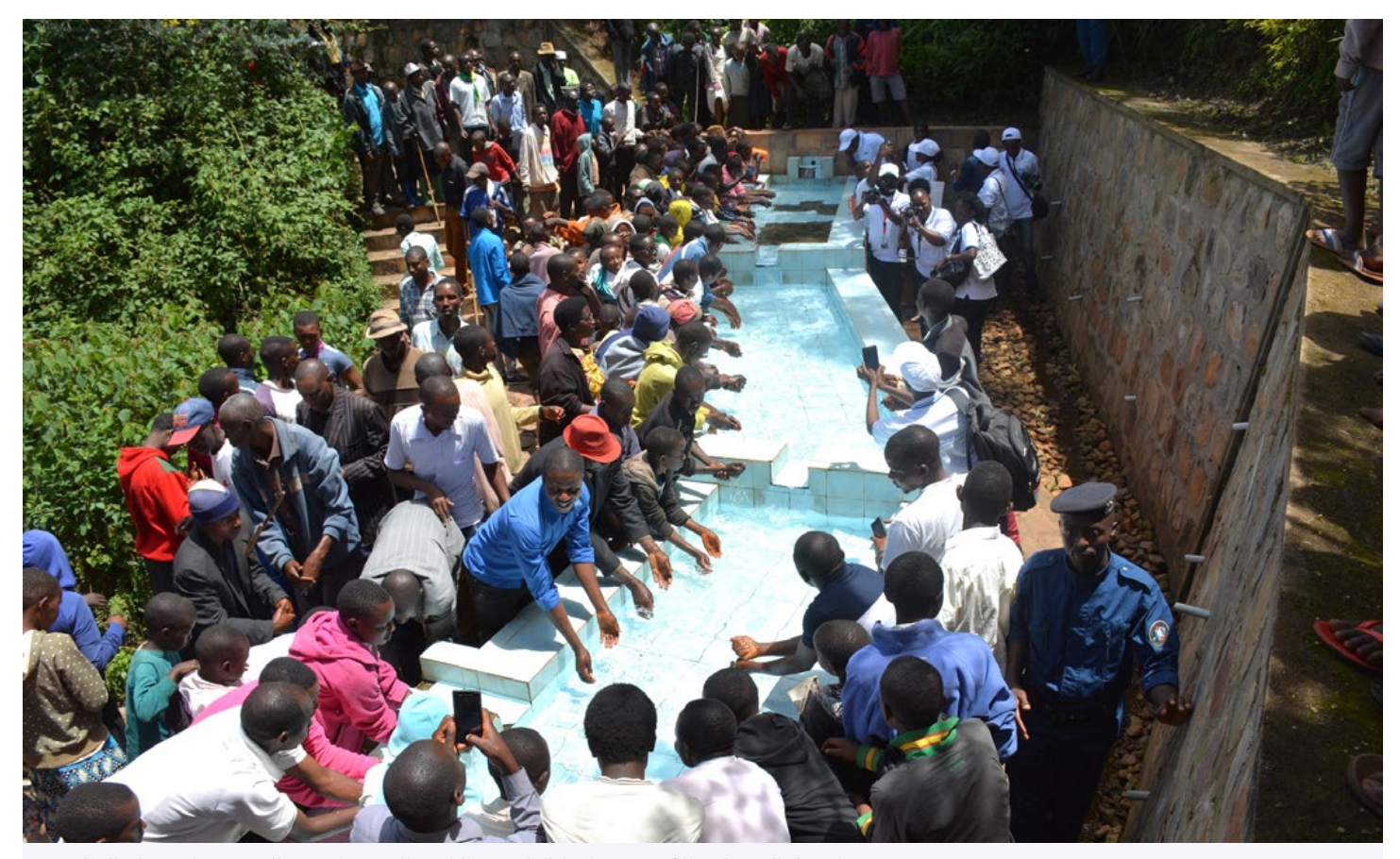
Dignitaries and community members gather at the most distant source of the River Nile in Rutovu