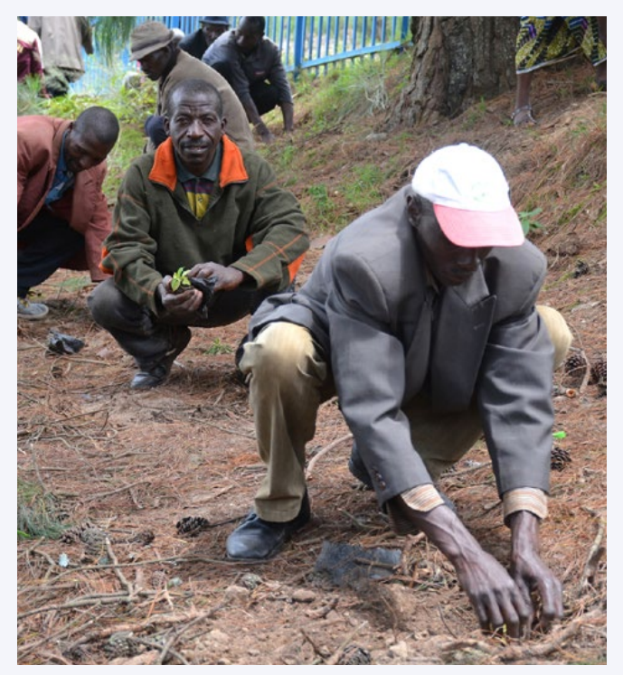
Community members plant trees at the most distant source of the River Nile

Find out more about The Year of the Nile Basin: <u>http://</u> <u>nbi20.nilebasin.org/</u>