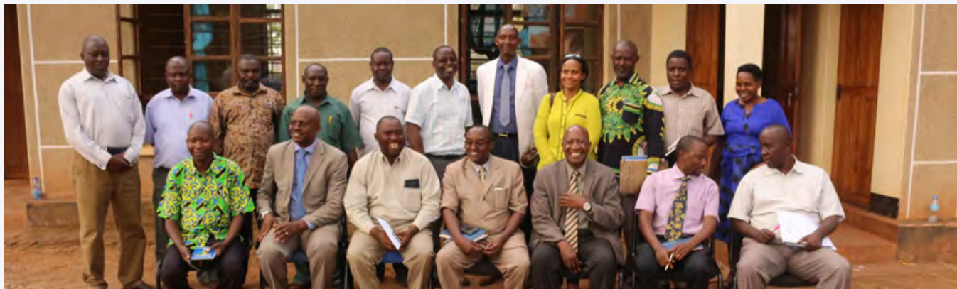
Ngara district officials and NELSAP Project Implementation Unit Staff after signing an MoU on LADP Ngara

W hile construction of the 80MW Rusumo Power Plant may have led to the displacement of some communities, the Project Affected Persons have been resettled through the Livelihood Restoration Project. Funds have been made available for Local Area Development Plans (LADP) for Busoni (Kirundo province) and Giteranyi (Muyinga province) communes of Burundi; Kirehe and Ngoma districts of Rwanda; and Ngara district of the of Tanzania.