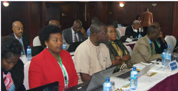
Nile-TAC members (front row) and NBI Management staff (back row) during the meeting

« The meeting agreed on a provisional approval for the institution to continue operating in line with its 2017/2018 first quarter workplan and budget. »