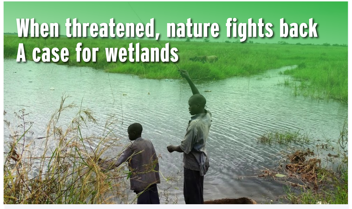
Children fishing in a wetland

t a glance, wetlands - large expanses of swamps - seem like public nuisances, a waste of space; occupying prime land which could otherwise be turned into sprawling shopping malls, hotels or theme parks devoid of any green.