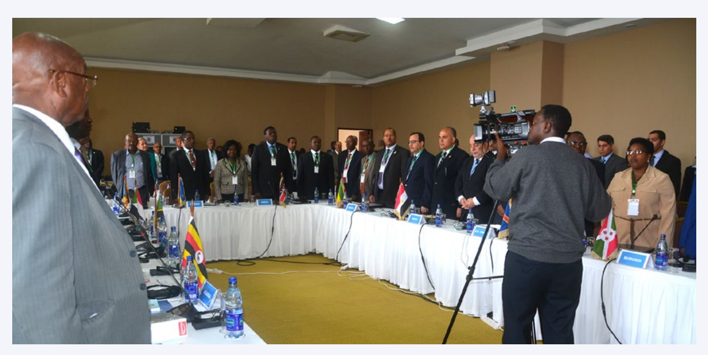
Opening ceremony of the 24th Annual Nile-COM meeting

The 24<sup>th</sup> annual Nile-COM meeting was attended by Ministers in charge of Water Affairs or their representatives from the Nile Basin states, officials from the government of Uganda, Nile-TAC members, development partners, representatives of civil society, and management staff of NBI, among others.