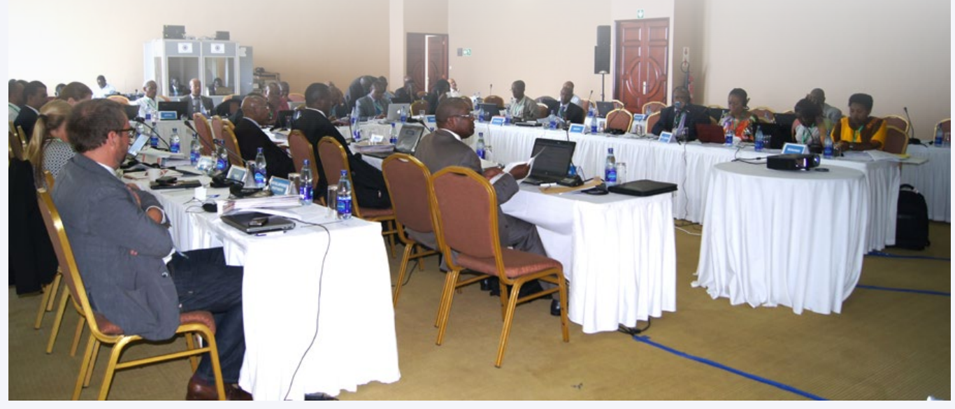
Nile-TAC members during the meeting

he 46<sup>th</sup> Nile Technical Advisory Committee (Nile-TAC) meeting was held on 13<sup>th</sup> July, 2016 at Protea Hotel in Entebbe, Uganda. The purpose of the meeting was to prepare for the 24<sup>th</sup> annual Nile Council of Ministers (Nile-COM) meeting which took place on the 14<sup>th</sup> July, 2016 at the same venue.