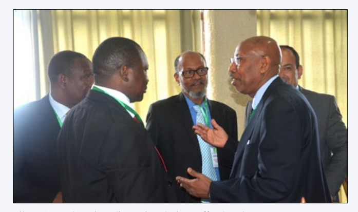
Nile-TAC members in a discussion during coffee break