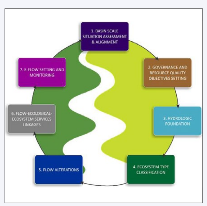
The Nile E-flow management framework: A seven-phase approach

The NBI governance recently approved the Nile Basin Environmental Flow Management Strategy and the Technical Implementation Manual. This was during the 24<sup>th</sup> annual Nile Council of Ministers (Nile-COM) meeting held in July 2016, in Entebbe, Uganda. The Strategy aims to achieve sustainable water resources development through management of the Nile Basin's flows required to sustain the freshwater and estuarine ecosystems and the human livelihoods and wellbeing that depend on these ecosystems. The Strategy defines the guiding principles, strategic objectives and strategic action areas as well as, implementation arrangements and responsibilities.