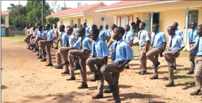
School children entertain guests