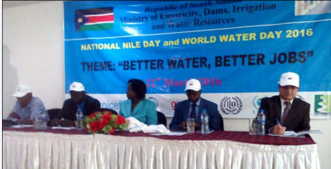
South Sudan's Minister for Electricity, Dams, Irrigation and Water, Hon. Jema Nunu Kumba (Center) and other dignitaries during an event held to jointly commemorate Nile Day and World Water Day in Juba, South Sudan