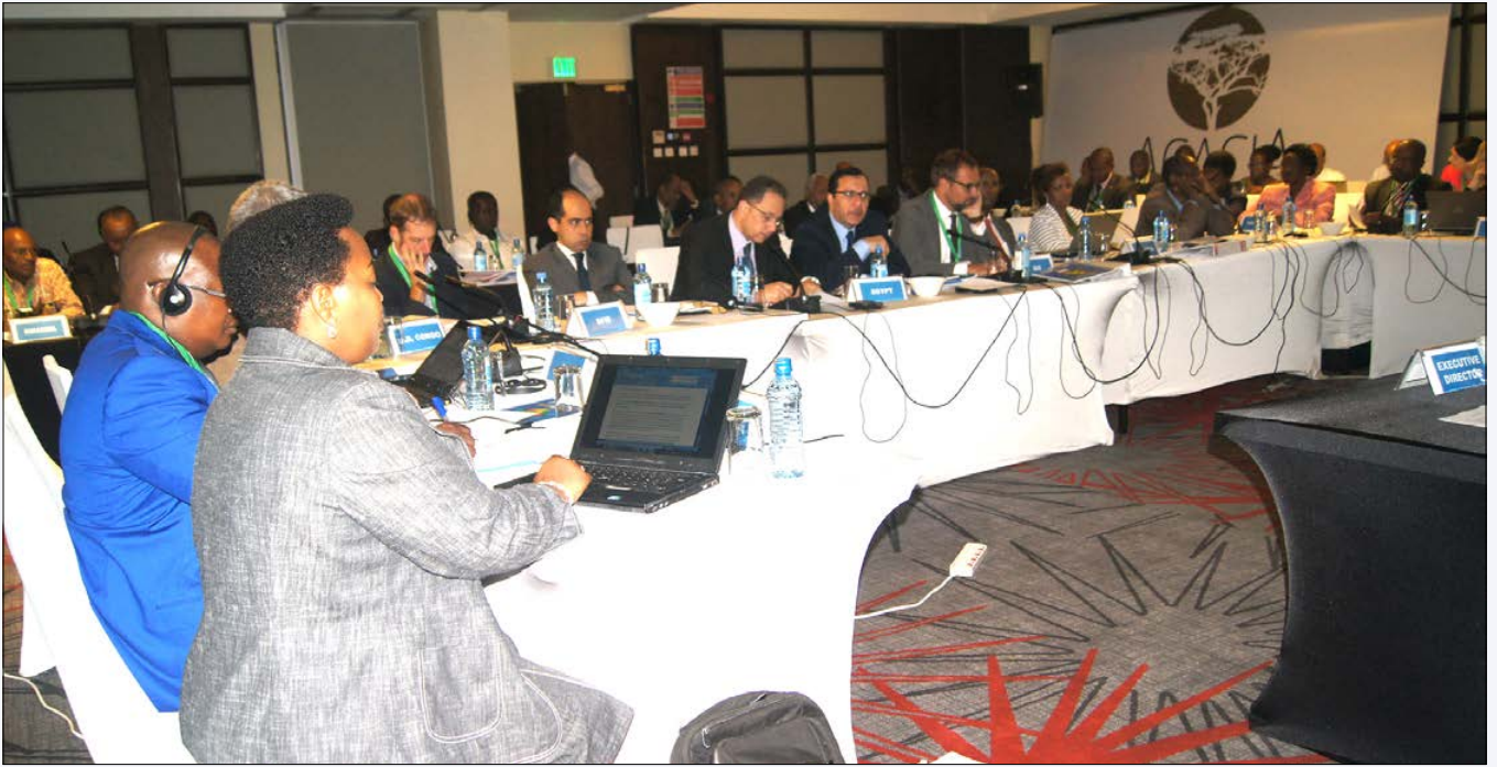
Participants during the 9 th Strategic Dialogue