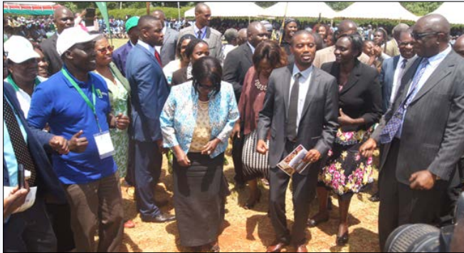
Celebrative mood: Dignitaries join dancers to celebrate the 'birth' of NBI