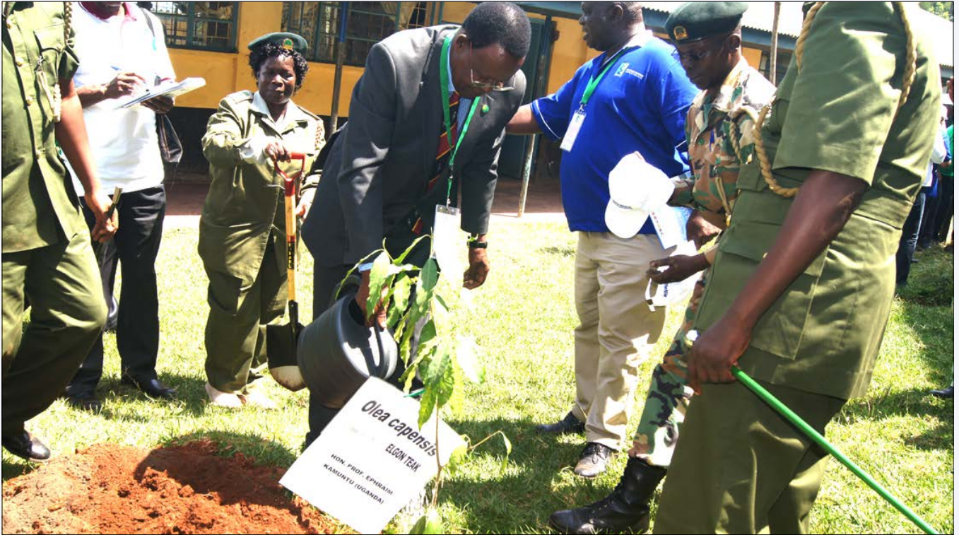
Hon. Prof Ephraim Kamuntu, Uganda's Minister of Water and Environment, plants a tree at Vihiga Friends High School