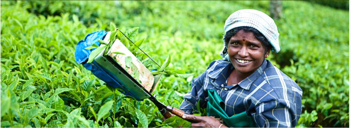
Woman harvesting tea leaves

On 8 th March, 2016, the world once again marked the annual International Women's Day, to reflect on progress made, call for change and celebrate acts of courage and determination by ordinary women who have played an extraordinary role in the history of their countries, communities and organizations.