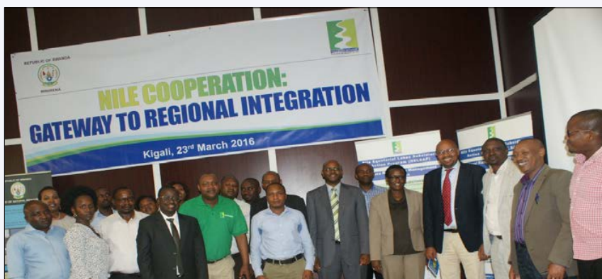
Some of the participants who took part in the celebrations

The event held during the World Water Week brought together officials from various ministries including Natural Resources, Infrastructure, Agriculture, and Foreign Affairs. Others were staff from Nile Equatorial Lakes Subsidiary Action Program (NELSAP-CU), water related organisations, as well as the civil society representatives.