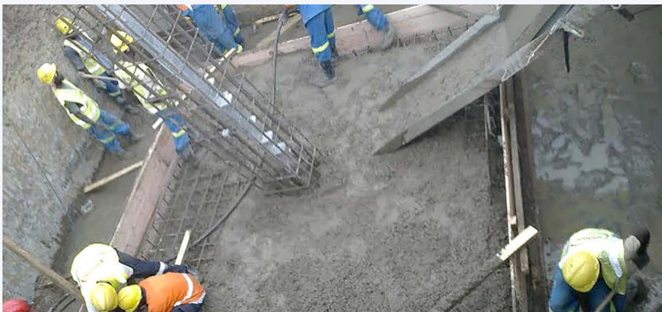
Interconnection Project. Concreting of Pad March 2015