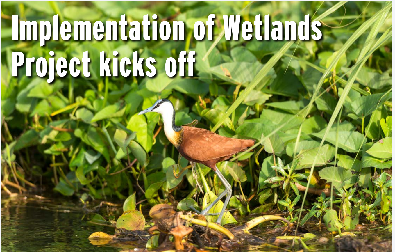
African Jacana in a wetland

T he River Nile and its tributaries flow through enormous wetlands of great relevance for biodiversity conservation. These wetlands provide important ecosystem services and therefore have significant socio-economic value. Management of the wetlands has major impact on river flow regime, patterns, seasonality and variability.