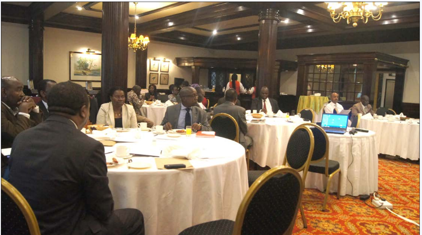
Principal Secretaries and Directors of various ministries at the breakfast meeting