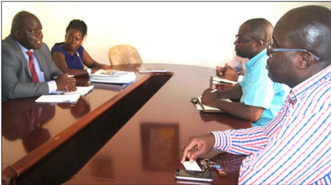
The team from the Secretariat and editors at The Observer in a meeting