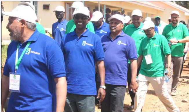
Participants march as part of activities to commemorate Nile Day