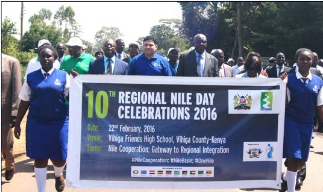
Celebrants march in Vihiga county