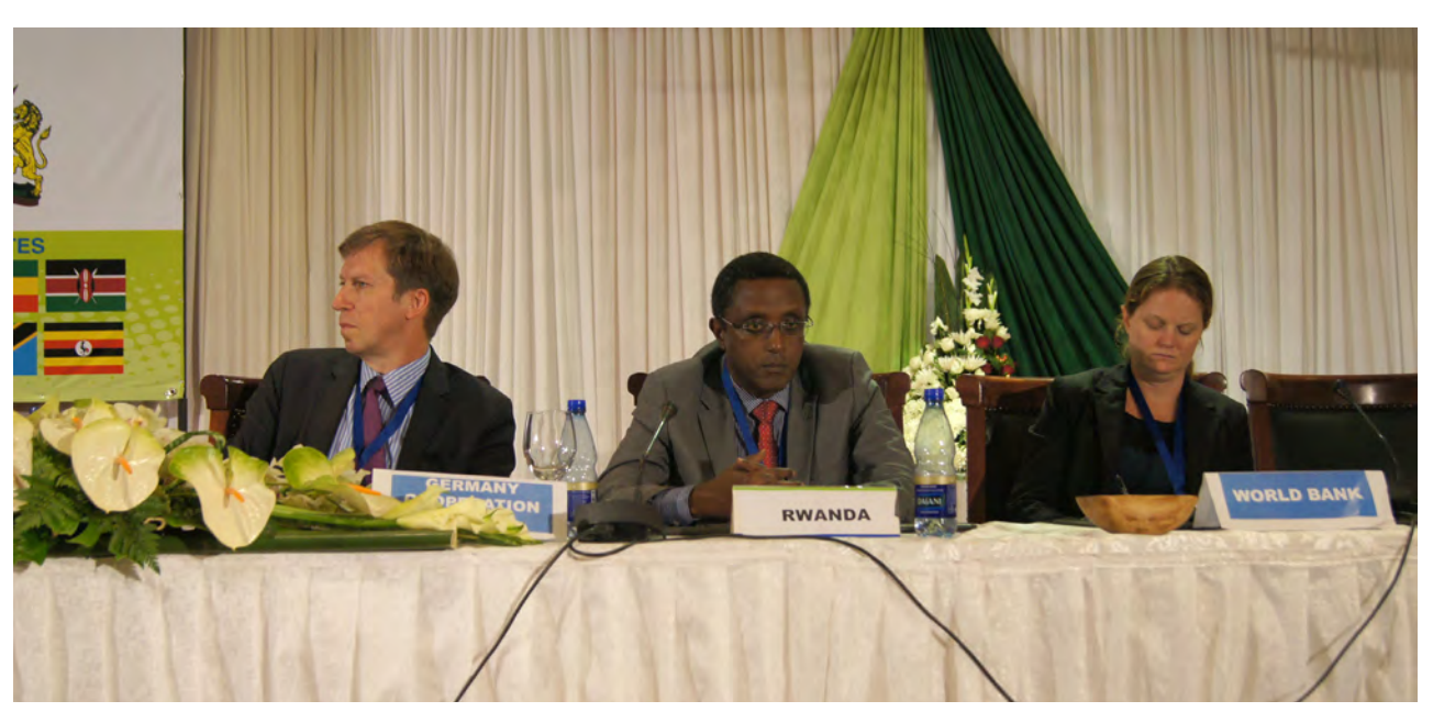
Head Table Session XIII

Session overview: The objective of this session was for high level representatives and stakeholders to: deliberate on the way forward for Nile cooperation, putting the outcomes and recommendations that have emerged over the two days deliberations as a basis for future decision making at the highest level and to renew the commitment of high level decision makers to sustain and advance the cooperation to a higher level.