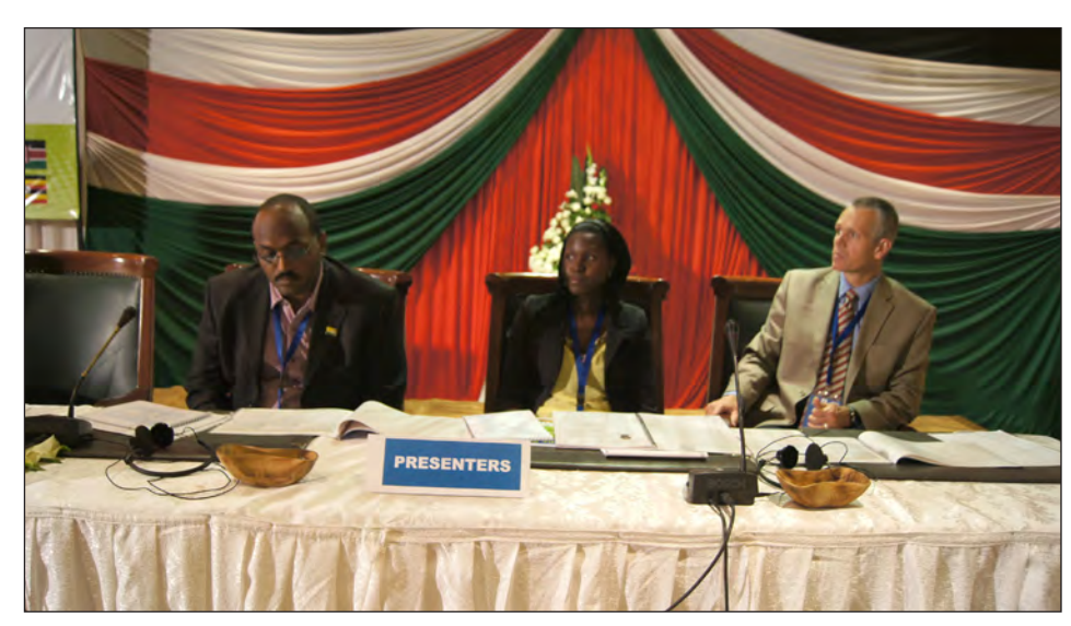
Head Table - Session II

Session overview: This session took stock of the existing knowledge on the Nile basin hydrology, including evapotranspiration, erosion/sedimentation and impacts of climate change. The objective was to further build a shared understanding on the resource base and to highlight the important role of hydrological monitoring for advancing Nile cooperation.