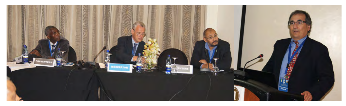
Head Table Session VI

Session overview: The session explored how the water and energy systems interconnect in the Nile Basin. The discussion focused on how a nexus perspective can induce policy- and decision-making that accounts for external effects across sectors - reducing the negative effects and maximizing the synergies.