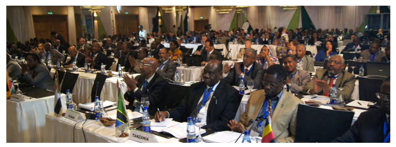
Participants during Session VII. Exploring Possible Futures for the Nile

Session overview: The session sets the scene for dialogue on possible and desirable futures of the Nile Basin, and on how we can achieve the future we want. Out of the three presentations, the first focussed on the science of scenario construction as a means for stakeholder engagement and policy planning. This was followed by two presentations, one by NBI and the second by Nile Basin Discourse (NBD), on results of recent scenario construction exercises for the Nile