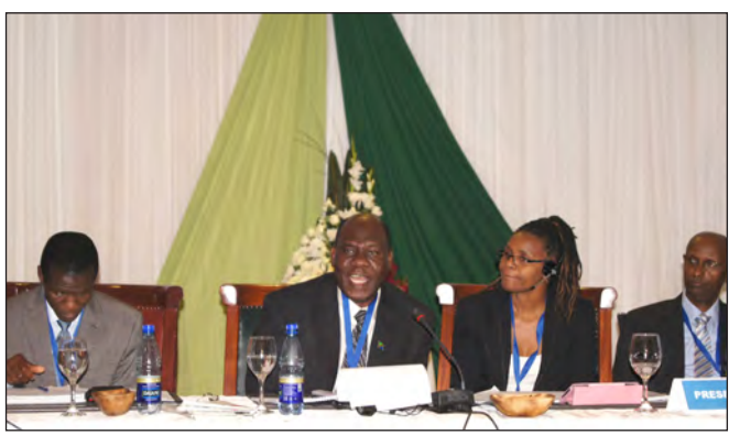
Head Table Session IX

Session overview: The session discussed the role of multi-level water governance for moving forward in Nile Cooperation. Short input presentations on the role of international and regional legal agreements, joint policy frameworks and the role of (sub-) basin organizations formed the basis for a panel discussion.