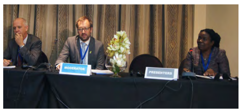
Head Table Session III

Session Overview: The session explored linkages between water and food security in the Nile Basin. It looked at scenarios of agricultural development and trade in the basin in relation to water security. Scenarios of food production and trade from a basin perspective and case studies on water use efficiency changes and management at the irrigation scheme and watershed levels were discussed.