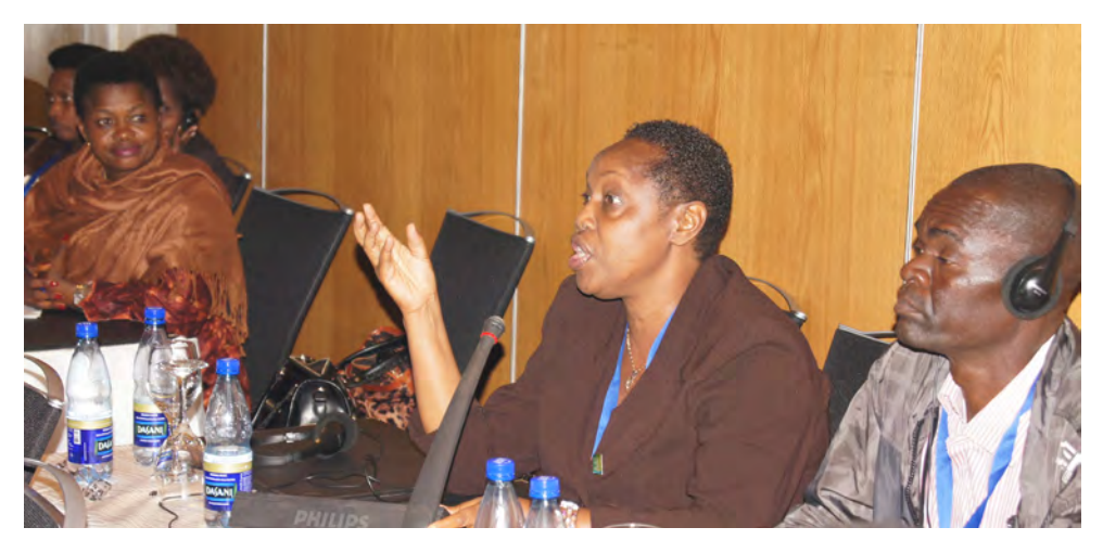
Participants on Nile Discourses

Session overview: The session takes an empirical approach to look at Nile discourses in the political and technical arenas and riparian communities. The objective is to better understand the role of social capital formation and stakeholders' perceptions for transboundary cooperation, and exchange lessons from 15 years of Nile cooperation.