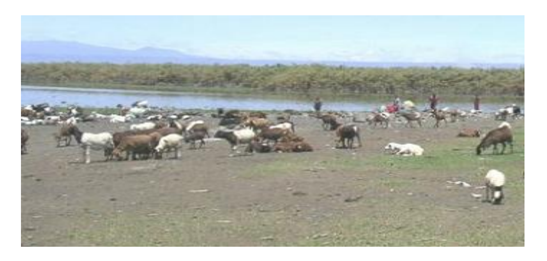
Migratory mammals depend on the Sudd wetland for their dry season grazing.