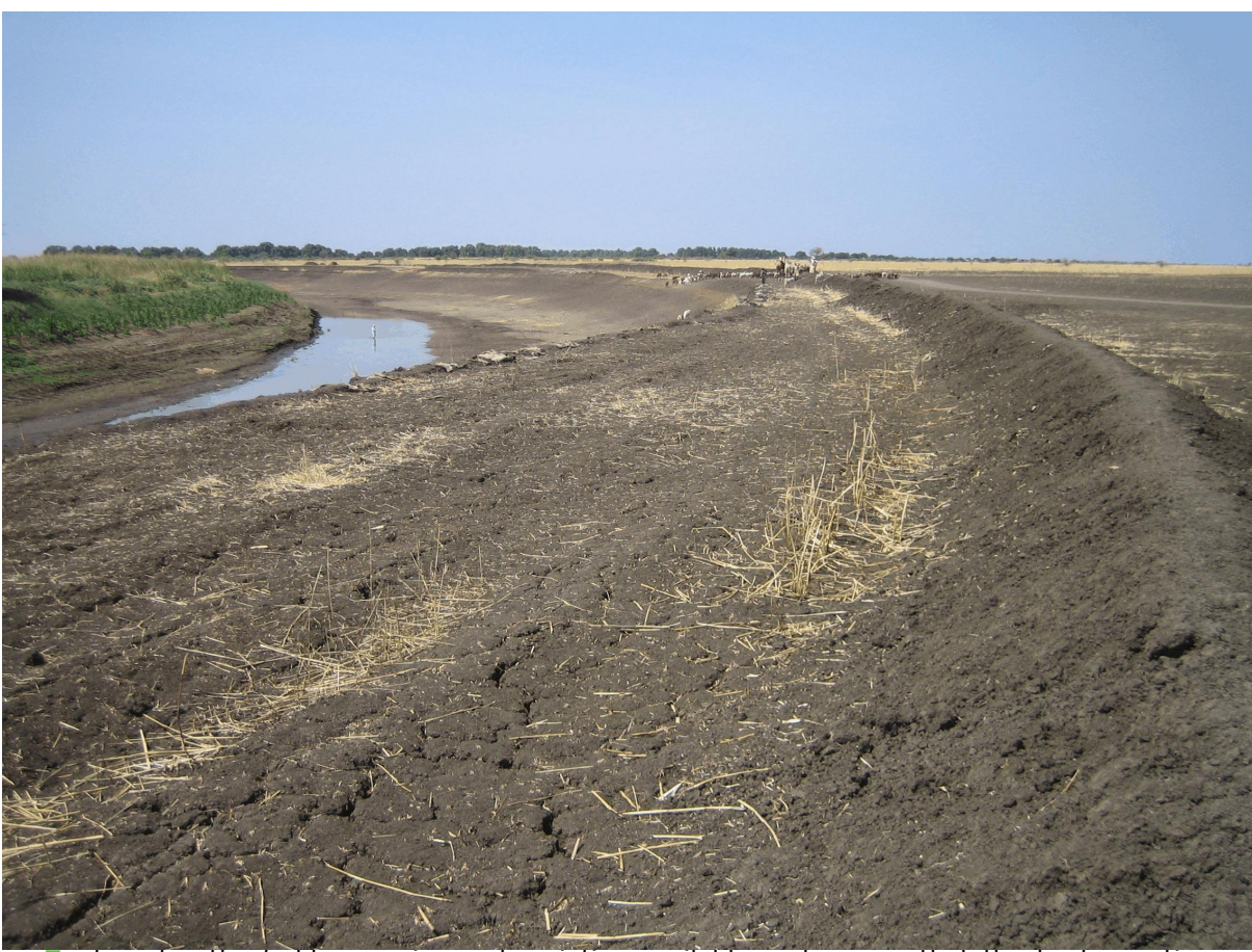
broaden the fodder species and varieties available and ensure that the best genetic material and propagation systems are used from the outset;