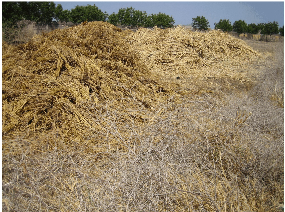
Figure 2.5: Sorghum stover and sesame haulm stored for use as livestock feed

Decentralization of the major agricultural support services consequent on the establishment of the federal system has led only partially to a real sharing of tasks especially in animal health delivery and extension provision. Training, policy formulation and financing remain largely the responsibility of the federal government. Service delivery is weak in many areas and much still remains to be done to make this an effective weapon in the development of Sudan's agriculture. Each of the 26 Federal States that constitute the Sudan Republic has an Animal Resources Department which includes animal health services and Gadarif is no exception in this respect.