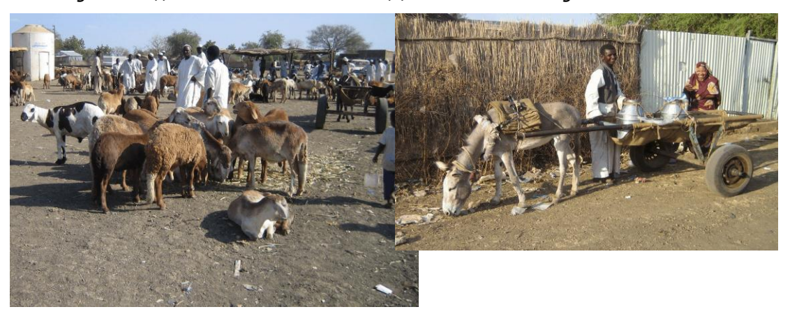
Figure 2.7: (i) Local livestock market and (ii) household marketing of milk in Hawata

Producers nonetheless may occasionally not have access to the most recent prices in larger markets away from the immediate area. Most villages hold weekly or daily markets (Figure 2.7(i)) at which several strata of producers, agents, 'wakil', middlemen and final purchasers are present. Other commodities such as eggs and milk (Figure 2.7(ii)) find readily available outlets through local largely informal channels and networks.