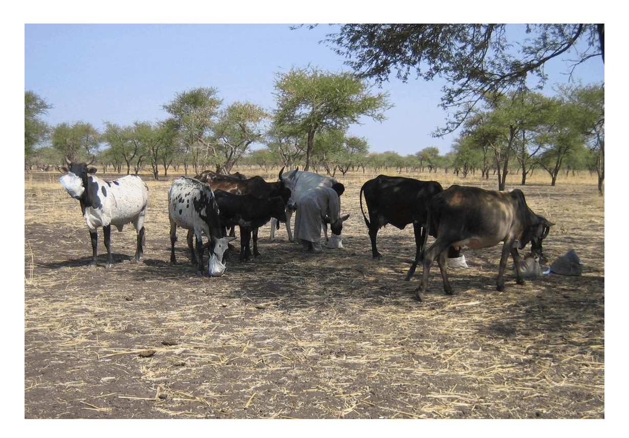
Figure 2.2: Feeding a sesame-based supplement to range cattle to increase milk production

Many owners are also aware of the value of supplementary feeding: although this is not practised as a general rule because of the expense and difficulty of obtaining concentrates some owners who have created for themselves a niche market in milk production does provide their lactating cows with supplementary feed (Figure 2.2).