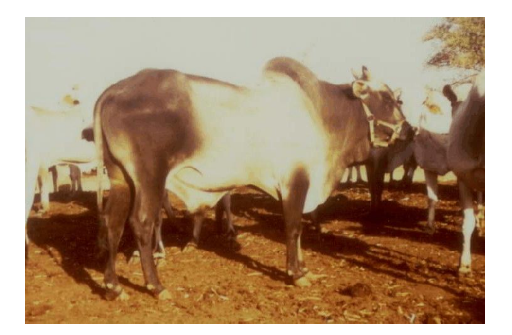
Figure 2.3: Kenana stud bull at Um Banein Research Station