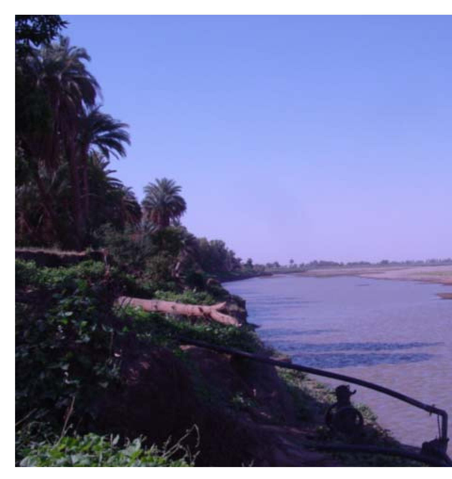
Plate No. 3: River bank erosion along the Main Nile River (Barber area)