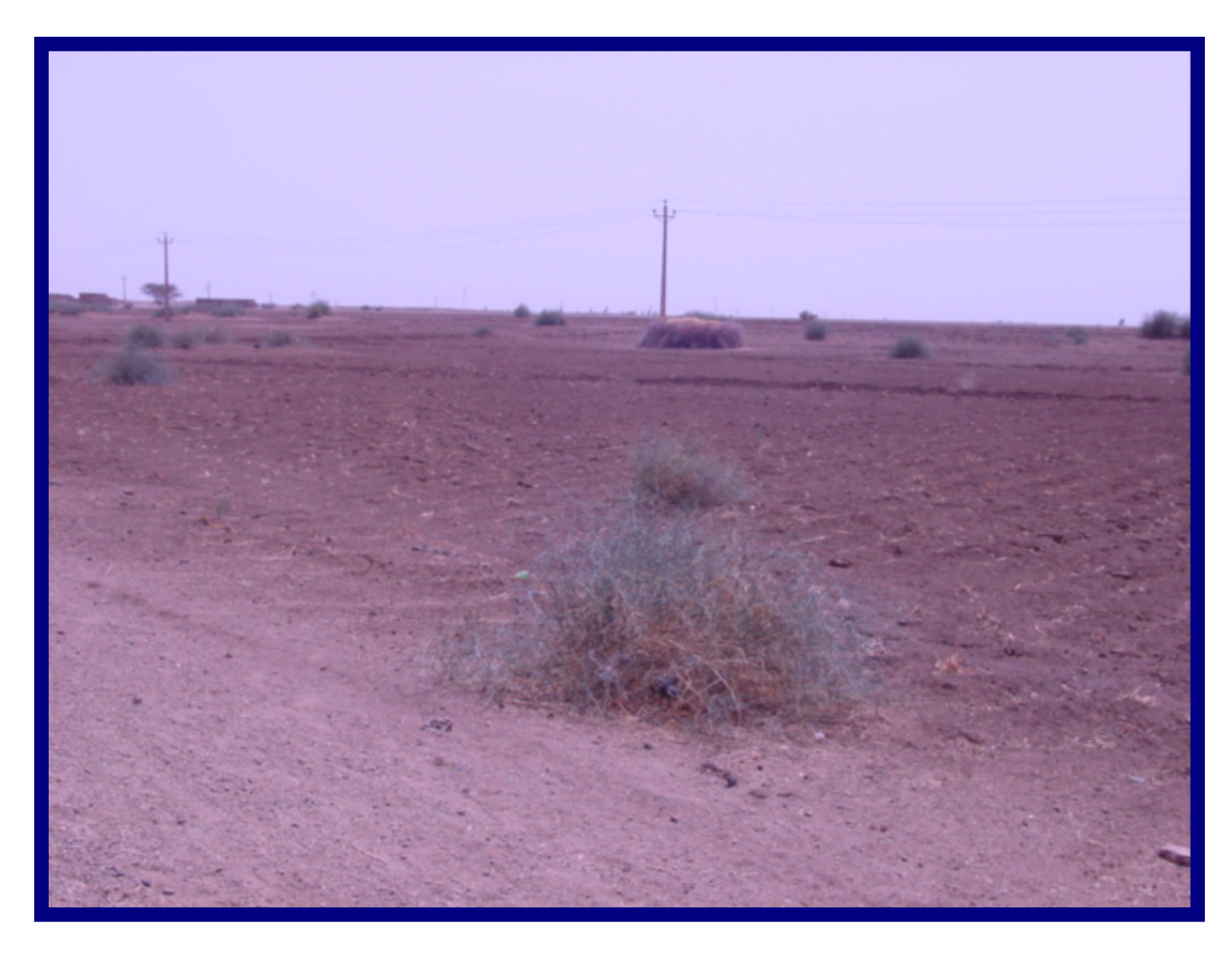
Plate No. 5: Lack of conservation practices on rain-fed agriculture