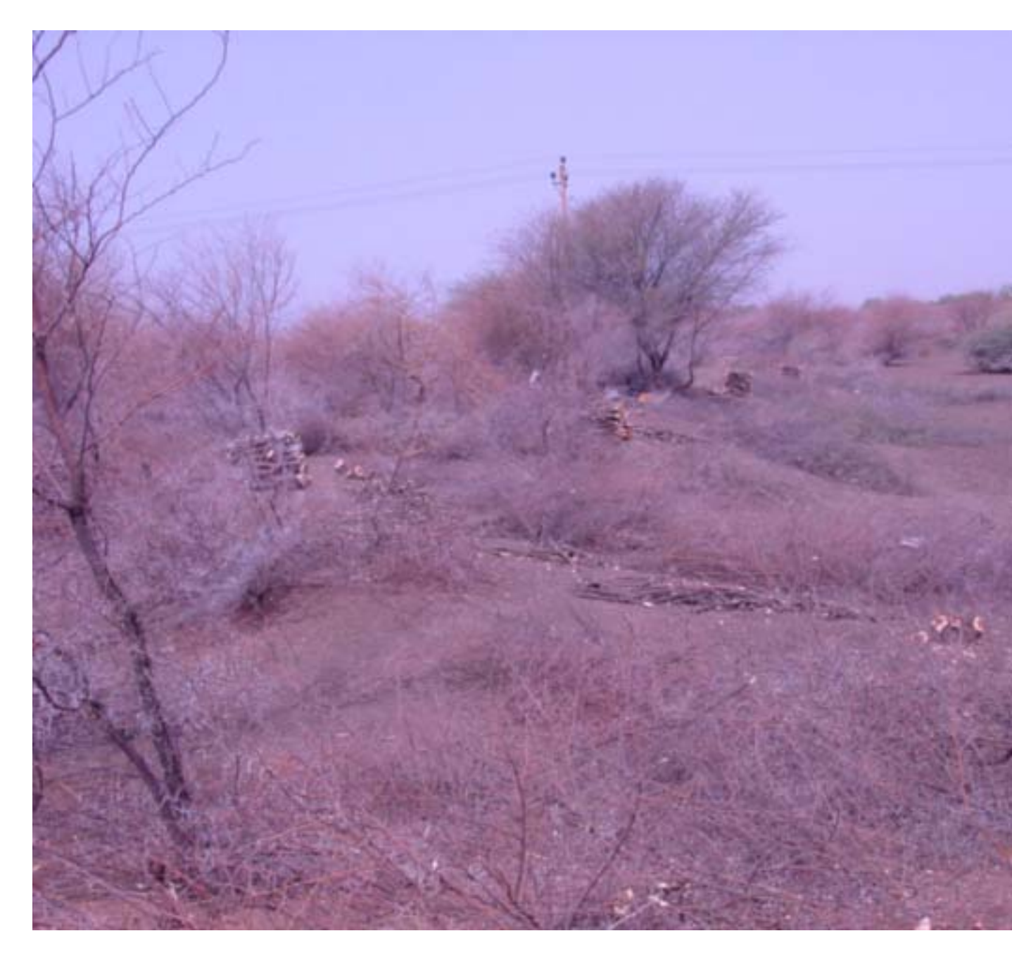
Plate No. 8: Cut and drainage area planted to trees lot