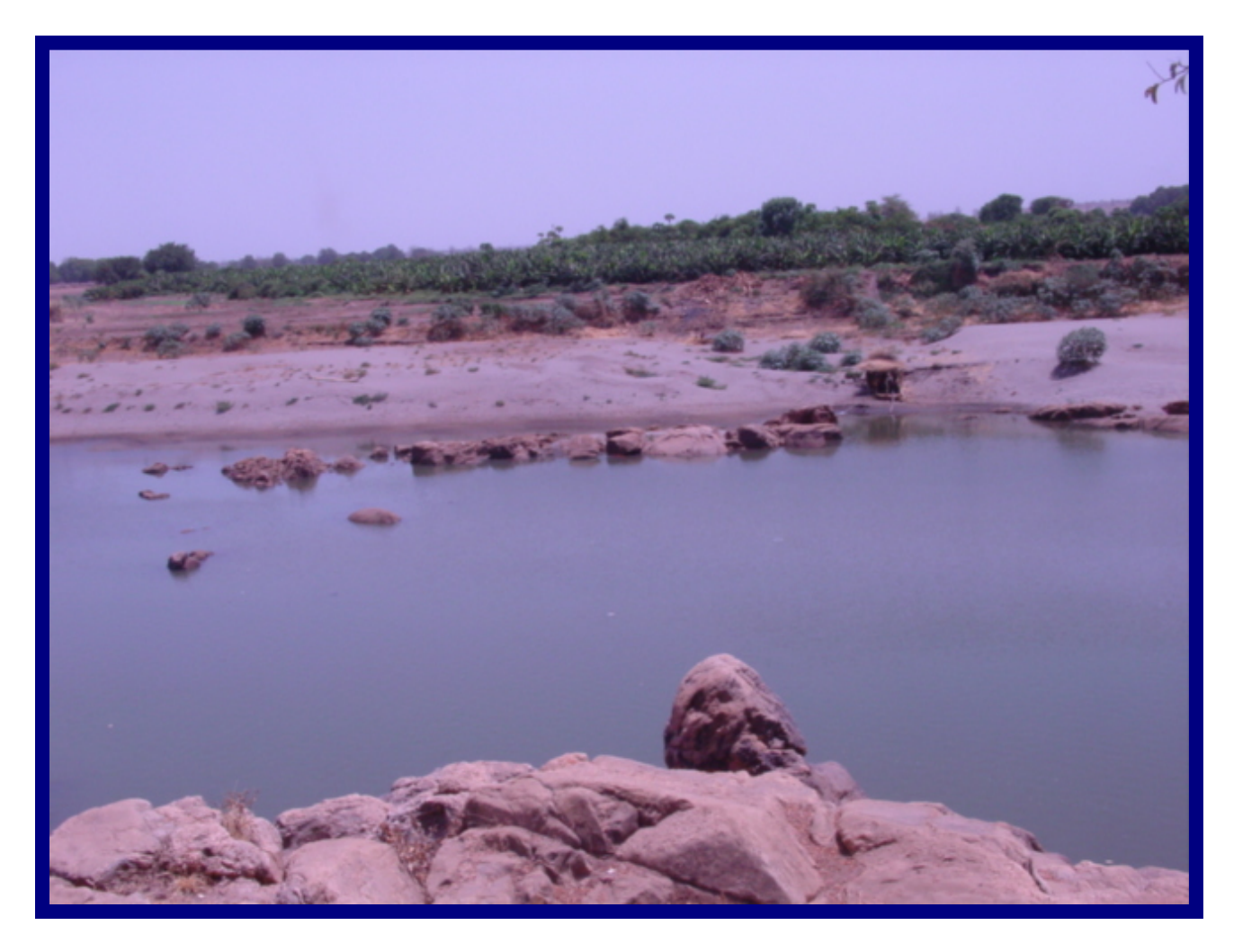
Plate No. 2: Banana plantation on the Blue Nile banks (Roseiris area)