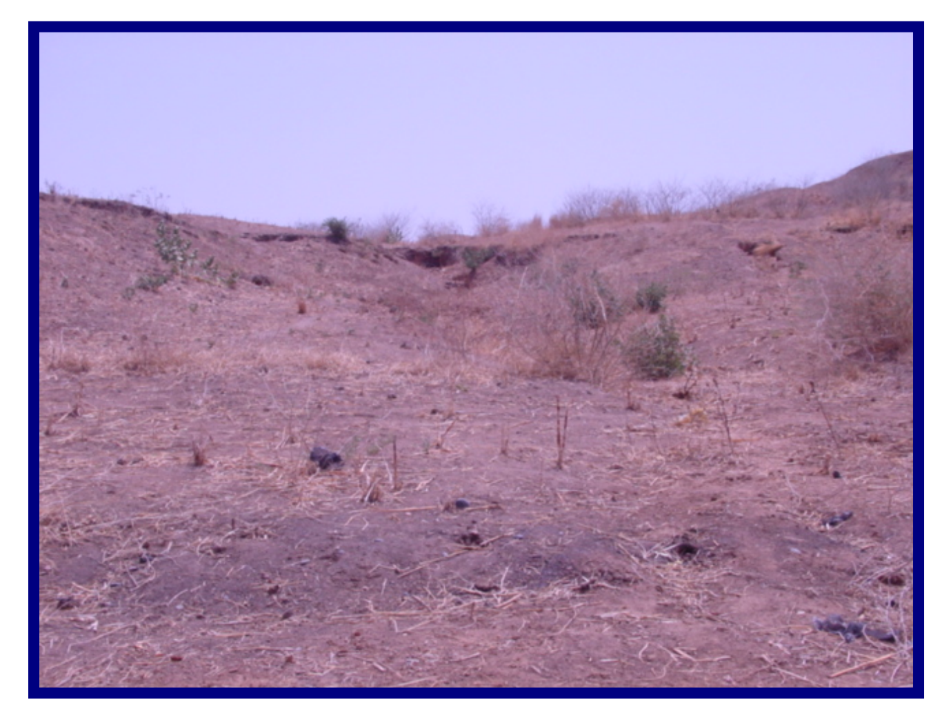
Plate No. 1: Cultivated gully floors in the Blue Nile area (UmRamad)