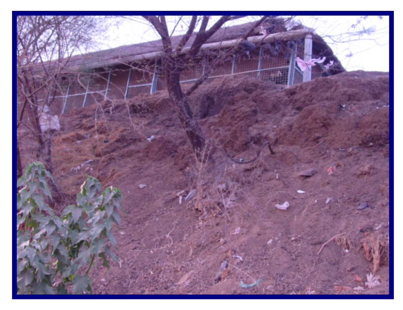
Plate No. 4: River bank erosion undermining property close to the bank (AlSuki)