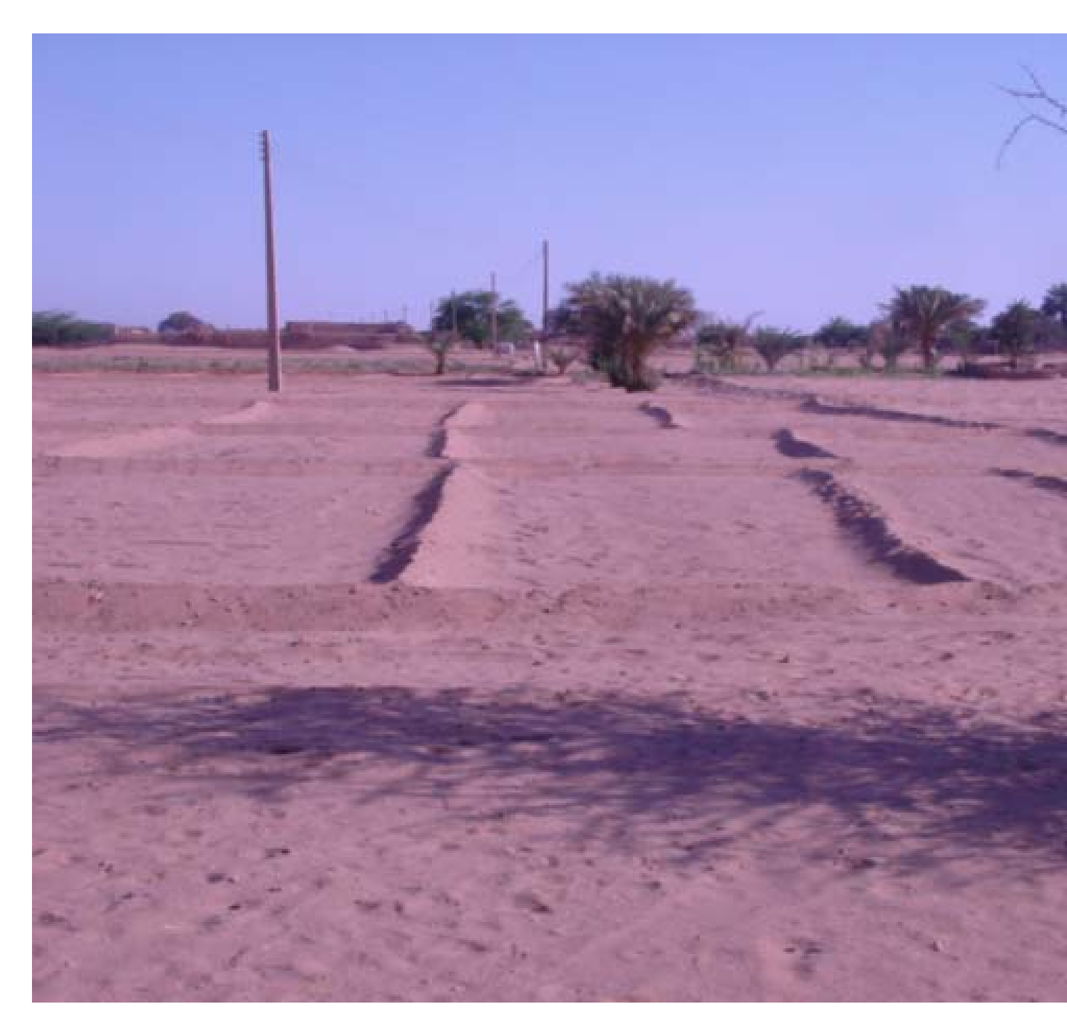
Plate No. 6: Desert encroachment on arable lands (Alshigla village, north of Atbara town)