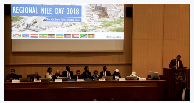
Delegates at the UNECA Conference Centre in Addis Ababa