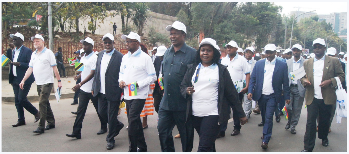
Ministers in charge of Water Affairs in the Nile Basin countries, together with Special German Envoy on Nile Affairs, march from Meskel Square to the UNECA Conference Centre in Addis Ababa, to mark Regional Nile Day 2018 event

hree females, each brandishing a mace, which they alternately threw up into the air and swung around, led the brass band as it snaked its way along a 1.8-kilometre stretch from the Meskel Square to the UN Conference Centre in Addis Ababa, Ethiopia. Following closely behind the band, were school children, Ministers of Water Affairs from the Nile Basin countries, NBI staff, development partners, civil society, media and members of the public, all marching to beautiful sounds from the band.