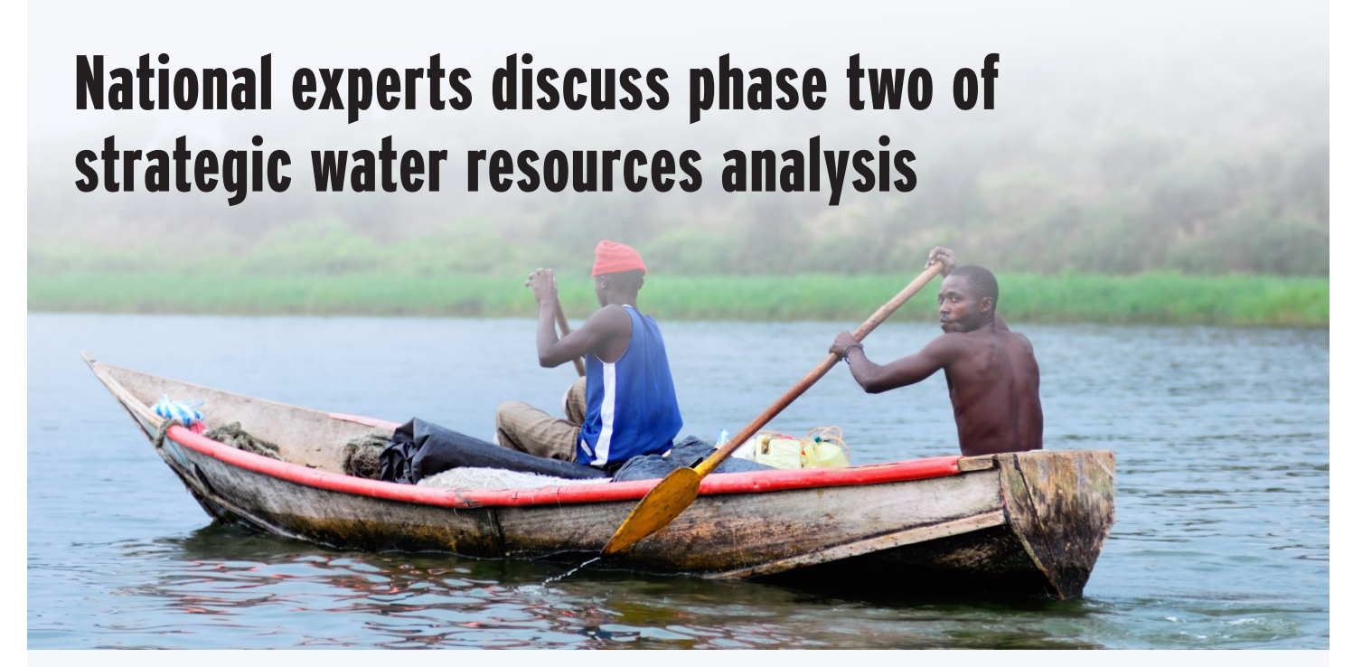
Fishermen on River Nile, a major water resource shared by the Nile Basin countries

he 3<sup>rd</sup> National Experts Group workshop on strategic water resources analysis took place February 19 – 20, 2018 in Addis Ababa, Ethiopia. Participants discussed and enriched the main building blocks and finalized the roadmap for the second phase of the analysis.