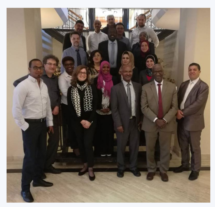
Workshop participants and trainers in Istanbul, Turkey

he NBI Secretariat took part as co-trainer in a workshop on Decision Support Systems and Water Diplomacy organized by UNESCO-IHE Delft – The Netherlands. The objective of the workshop was to enhance capacity on combined use of Decision Support Systems and Water Diplomacy techniques in addressing water conflicts.