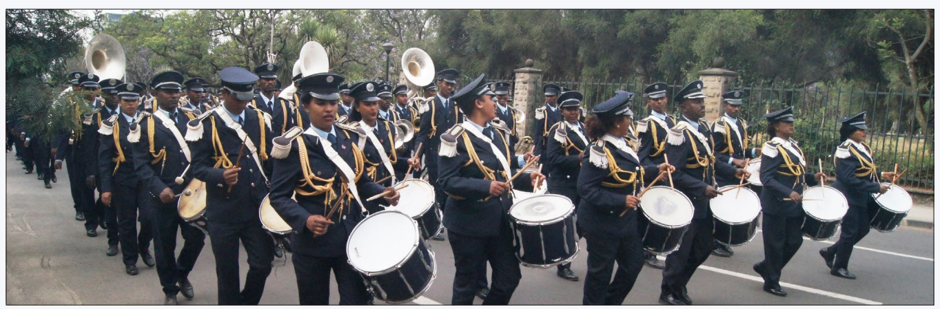
A brass band leads the procession from Meskel Square to the UNECA Conference Centre in Addis Ababa, to mark Regional Nile Day 2018 event