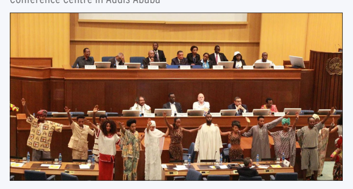
An Ethiopian Cultural Group entertains participants during the Nile Day celebrations at the UNECA Conference Centre in Addis Ababa