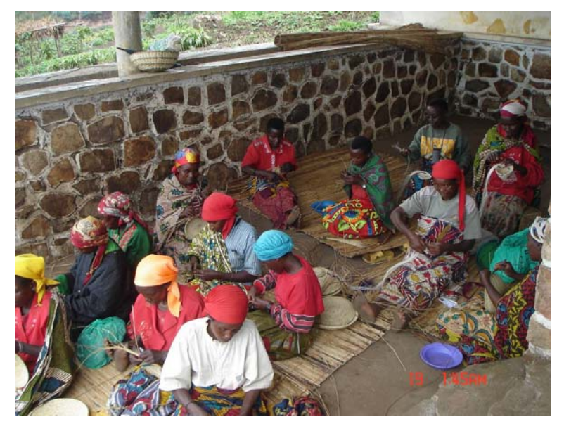
Poverty alleviation : Handi craft activities with the NGO AFEB (Association Femme et Environnement au Burundi) in Muramvya District, Muramvya province