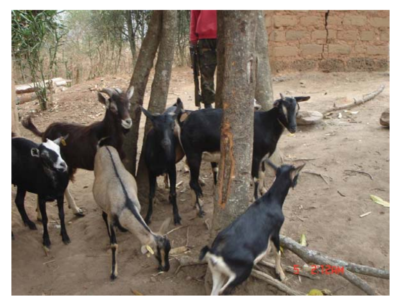
Soil fertilization and poverty alleviation : Goats breeding with the NGO Dukingiribidukikije, Buhinyuza District, Muyinga Province. Some goats were provided by CARITAS as a partnership to the NGO (following the good example from MG Program)