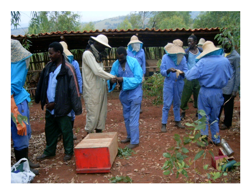
Biodiversity conservation and poverty alleviation : Training of bee keeping techniques for biodiversity conservation and income generation, made by the NGO APRN (Association pour la Protection des Ressources Naturelles) at MUTUMBA District, KARUZI province