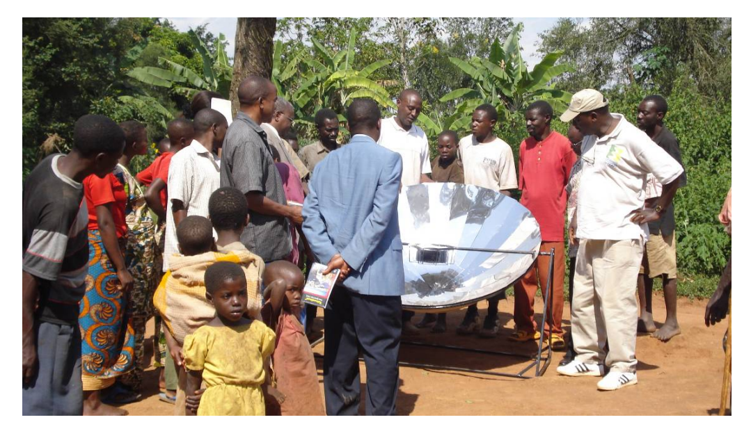
The use of alternative source of energy: Food solar cookers used by communities near the Rwihinda lake, KIRUNDO district, KIRUNDO ( a MG project initiated by the NGO ABO : Association pour la Protection des Oiseaux)