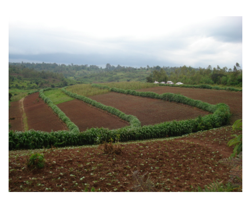
Erosion control and soil conservation : a farm with progressive terraces implemented by the CBO " Tugwanyinkukura" in BUHIGA district KARUZI province