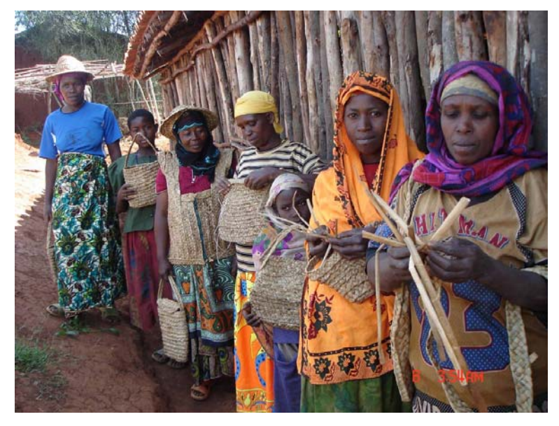
Wetland conservation and poverty alleviation : Handicraft activities using water hyacinth leaves stalks, by the NGO AGDB (Association pour la Gestion Durable de la Biodiversité au Burundi)