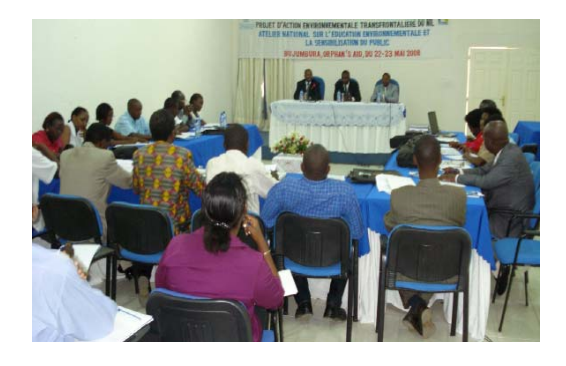
National EE Forum- Opening ceremonies by the NBI/ED, the Representative of the Minister for Environment and the General Director of the NIEWC

- The EE National Forum has been organized from the 22<sup>nd</sup> to the 23<sup>rd</sup> of May 2008. Thirty (30) participants attended the Workshop. They decided to extend the mission of the EE&A NWG after the project phase out under the Host Institution authority. Discussions will continue between NPC/NTEAP, NIEWC and EE&A NWG to refine the phase out strategy for the component.