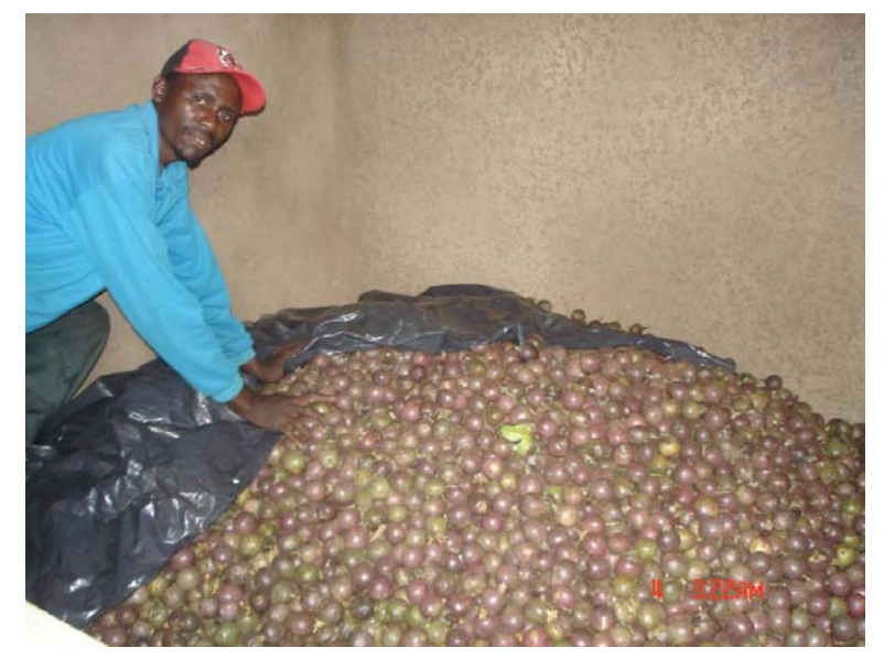
Food security and poverty alleviation: Passion fruits production with the NGO ADEANAK , Maton,go District, Kayanza Province