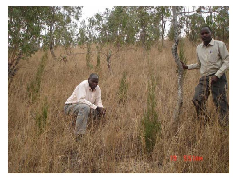
Environmental conservation: Trees plantation with the NGO « Jeunesse Providence Agakura » In Makebuko District, Gitega Province