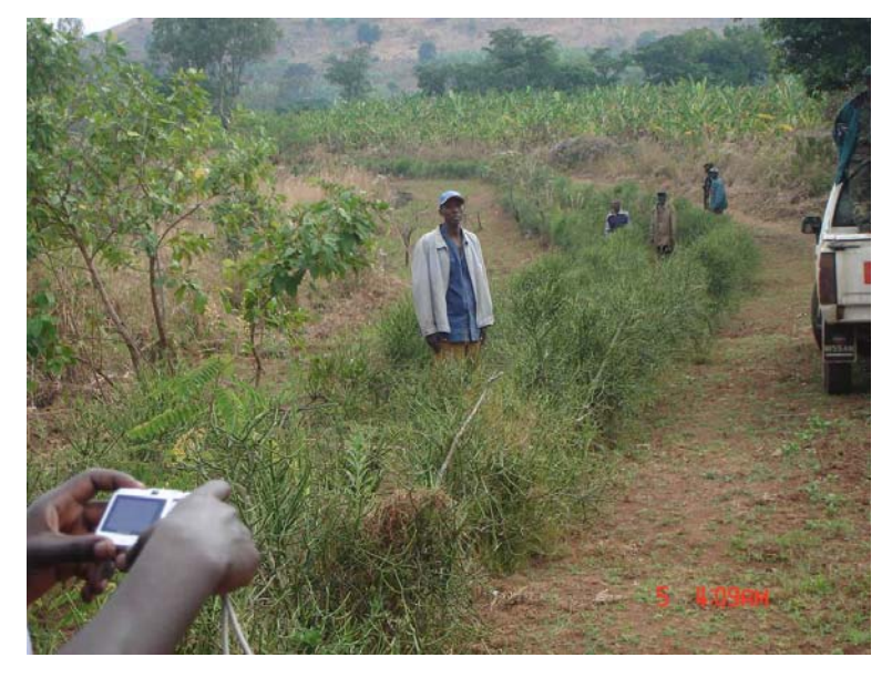
Natural resources conservation: Ruvubu National park natural fence made by the NGO Dukingiribidukikije, Buhinyuza District, Muyinga Province