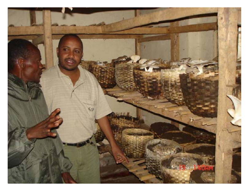
Poverty alleviation and food security : Mushroom production by the NGO AFEB (Association Femme et Environnement au Burundi) in Muramvya District, Muramvya province. A project beneficiary exchanging with the president of AGDB impementing the same activity in Muyinga province.