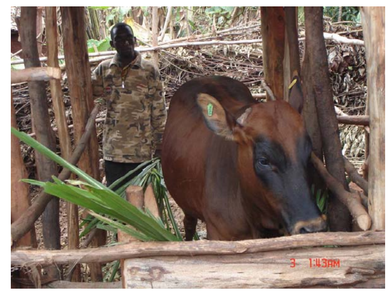
Soil fertilization: Cows breeding activities with the NGO APED (Association pour la Protection de l'Environnement et pour la Promotion du Développement) at KIDIDIRI Hill in Busiga district, NGOZI province